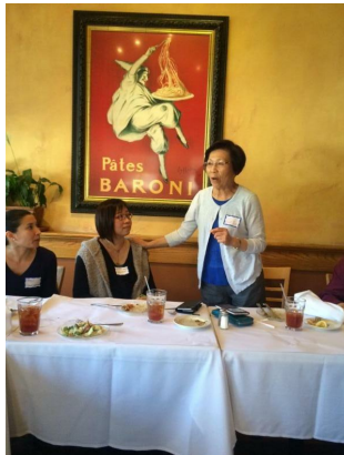
March Mixer at Fontana's Italian