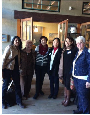
November's mixer at CooperVino

We look forward to having you join us and please bring a friend!