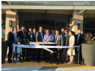
Hyatt House Ribbon Cutting